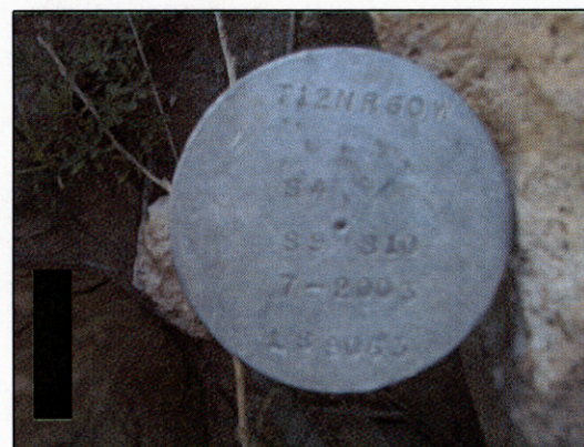
Monument Inscription (Accepted)